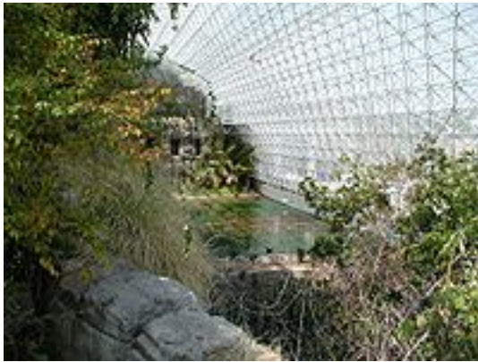
Biosphere 2 from the interior (foreground) here are the Salween (background) section

The Coastal Fog Desert section of Biosphere 2