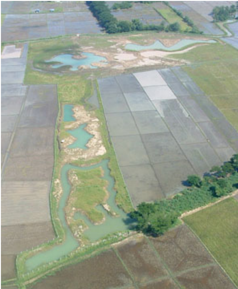
An ariel view of Pintig Ecovillage land (top is point of view from program site) and a winding canal, that is the waterway.