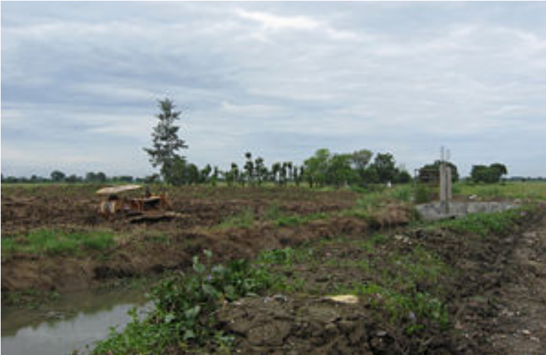
□ Pintig's 10-acre property was a rice field before recent excavation to create water