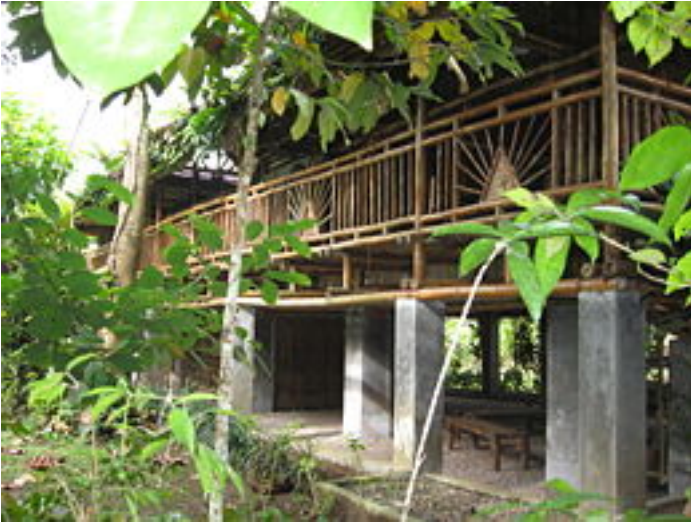
C.E.L.L.'s Brandon Hall shows what Pintig's community building might look like once it's built.