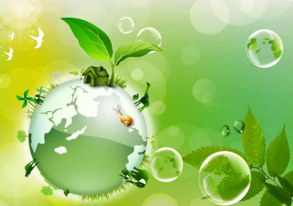
Figure 3: An artistic view of a ideal environment.